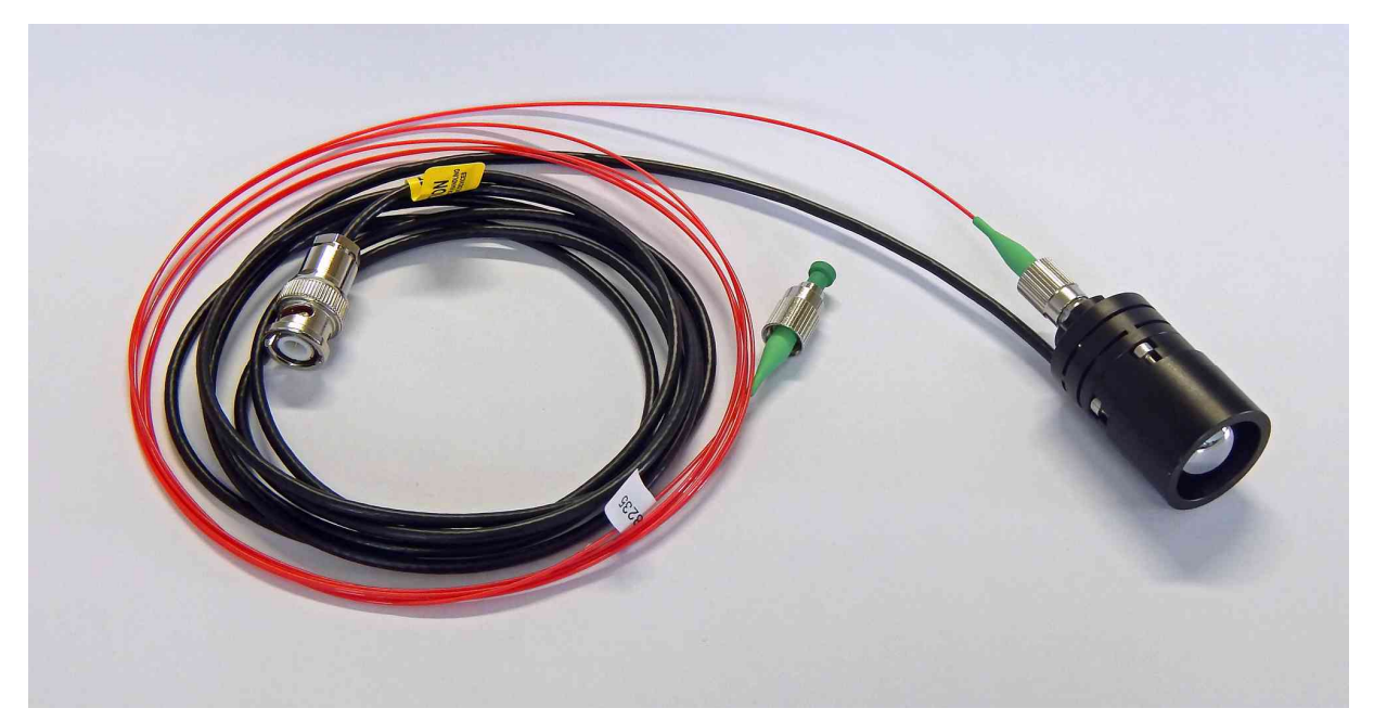
Fig. 1: fiber coupled antenna head with elliptic collimating silicon lens, polarization maintaining fiber and coaxial cable.

The FC-PCA is a single mode fiber coupled head for photoconductive emitter and detector antennas with a small gap up to 6 µm and FC/PC or FC/APC connector for optical supply.