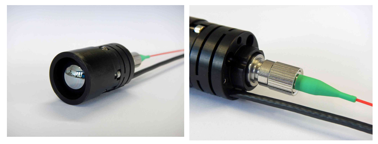
Fig. 2: FC-PCA: front few