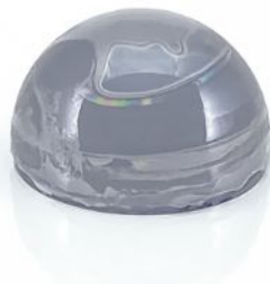
Figure 1: LSH-D12-T7.13 with Anti-Reflex-Coating

An Anti-Reflex coating is available on request.